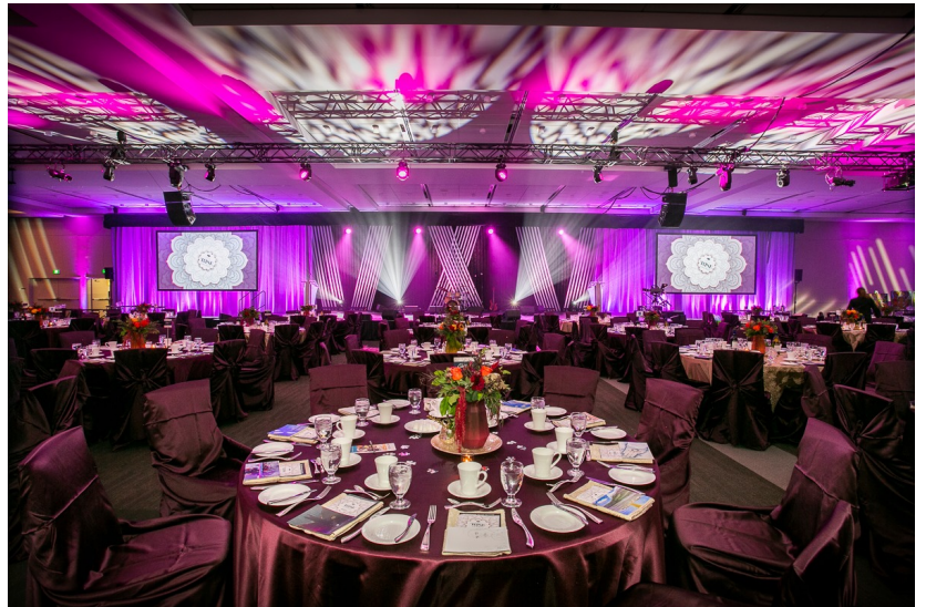
RISE Awards 2019