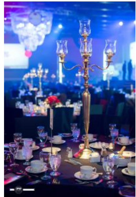
Award-winning CASA Gala