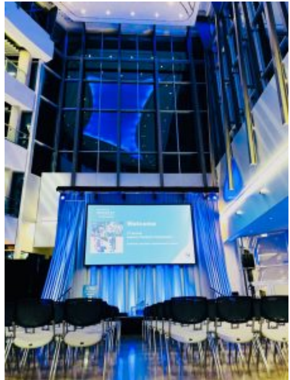
NAIT Industry Research Symposium 2018